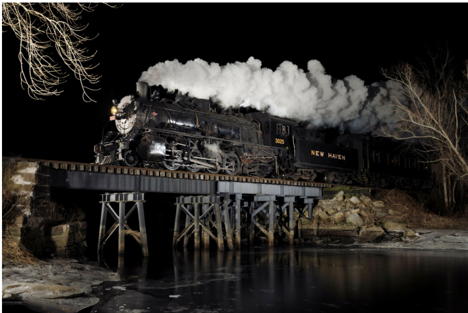
Deep River, Connecticut - 2016 New Haven 3025 hauls a train over the frozen Chester Creek.