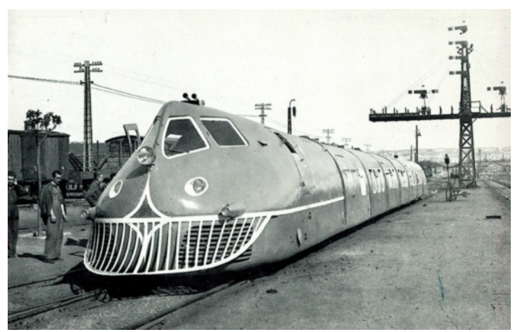
Below- Return of the PUZZLER . What is THIS?

French engine met its end in 1924 when front of boiler blew out taking tubes with it. Only picture we've ever seen like this.