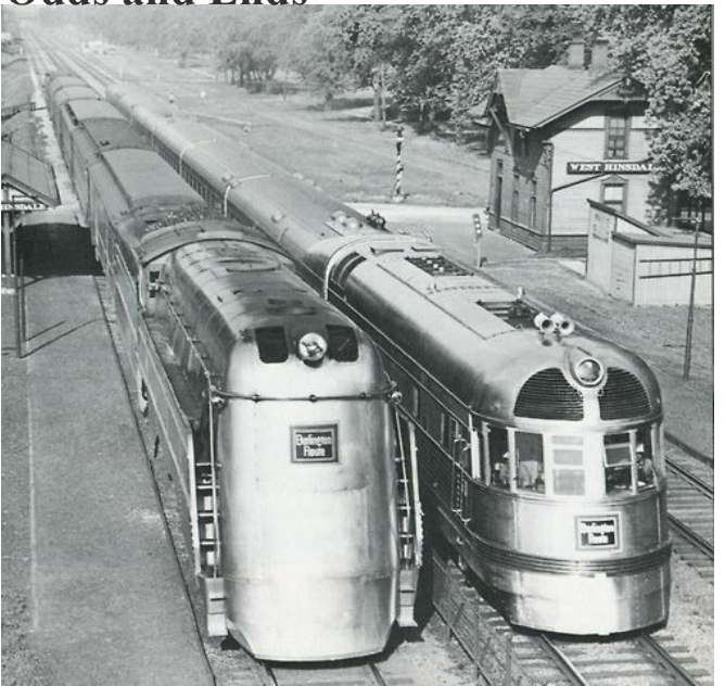
Family heritage - why streamliner looked that way

Denver & Rio Grande passenger engine F7A number 5661 wrecked on 19 December 1963 at Mill Fork, Utah in a head-on collision with a D&RG freight train lead by F7A number 5701. Both F7s were "retired" on January 16, 1964; traded in to EMD on the purchase of 8 GP35s. Note the buckling of the unit behind the cab area – THIS IS BY DESIGN. The buckling of the engine structure absorbed energy and helped prevent the crushing of the cab area thus working to protect the crew. This absorption of energy by controlled deformation of the structure feature is now standard procedure in the design of automobiles.