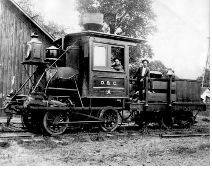
Above- small steam engine 1904. They don't come smaller.