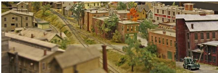
Sept 2013: Dick Elwell's Hoosac Valley