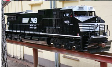
That's a GE D9-44CW sitting on the rack. Beautiful.