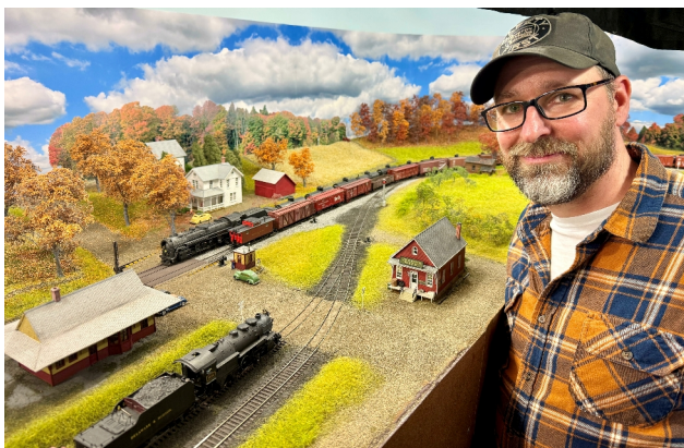
March 22, 2025 Rotterdam NY